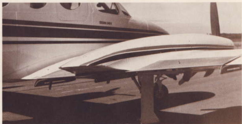
During cruise the Robertson Fowler-action flaps tuck neatly under the wing.