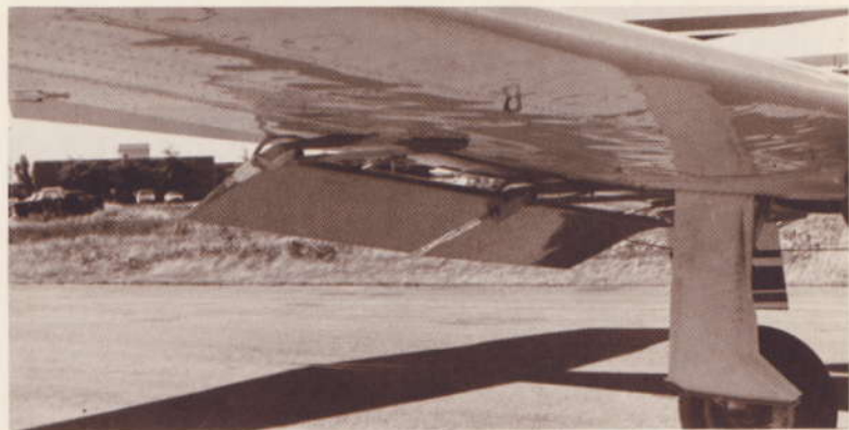
For landing, the flaps translate to their maximum aft position, 30 degrees for maximum lift.